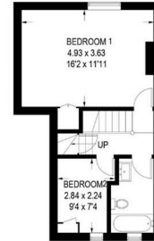
FIRST FLOOR 35.2 SQ M / 379 SQ FT

Illustration for identification purposes only, measurements are approximate, not to scale