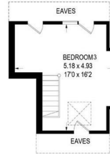
SECOND FLOOR 20.8 SQ M / 224 SQ FT