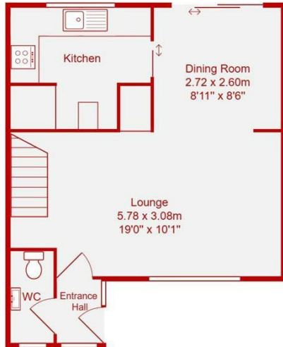
Ground Floor Area: 36.0 m 2 ... 387 ft 2