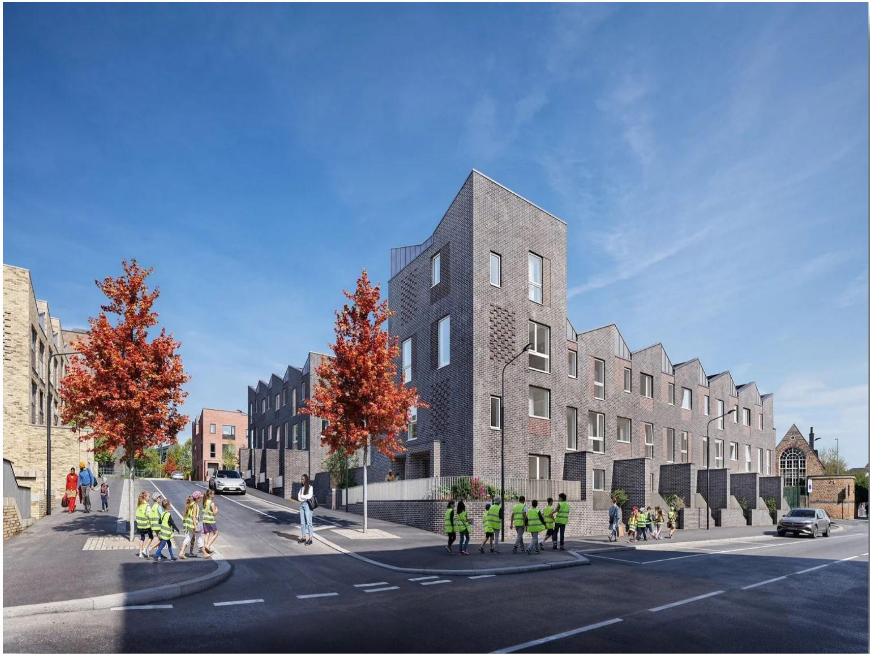
The Fruit Market, Nottingham NG1 1DE