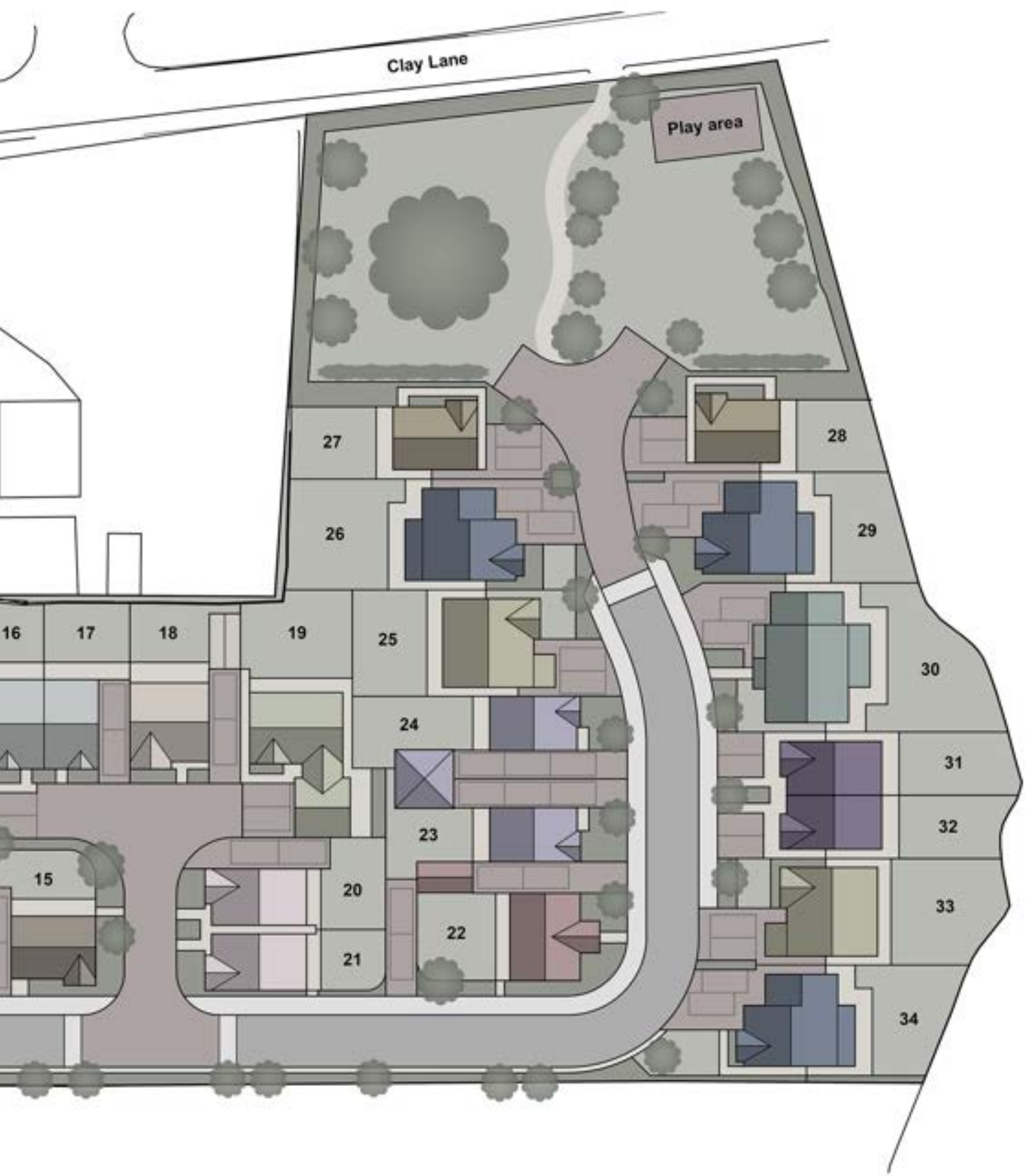
■ Oakedene 12 & 13