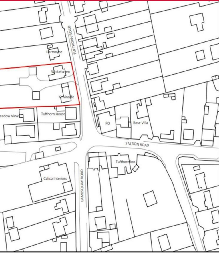
Existing Location Plan 1/1250