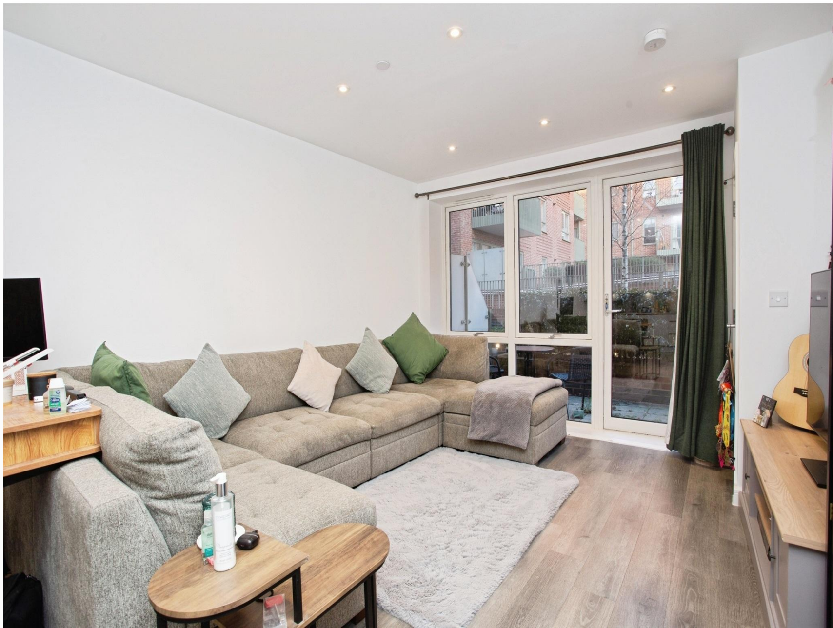
Nightingale House, Oxhey Drive, Watford, WD19 7FH