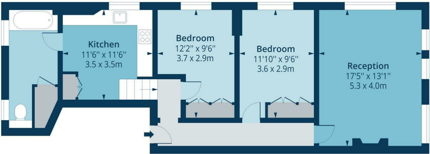
Second Floor Floor Area 826 Sq Ft - 76.74 Sq M