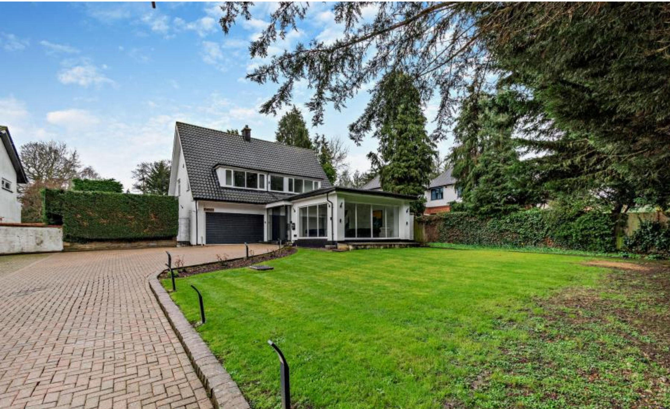
A fabulous four bedroom, three bathroom property with outdoor swimming pool Oxhey Lane, Pinner, Middlesex HA5 4AL