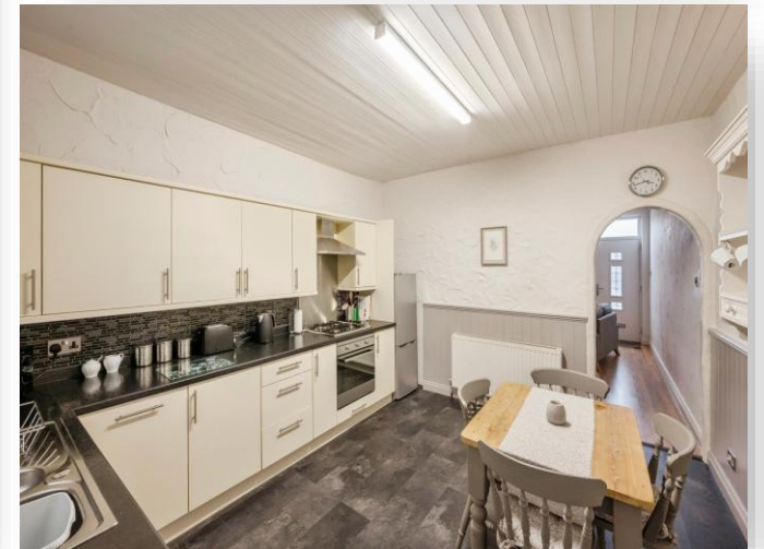
High Street, Goldthorpe Rotherham S63 9LL