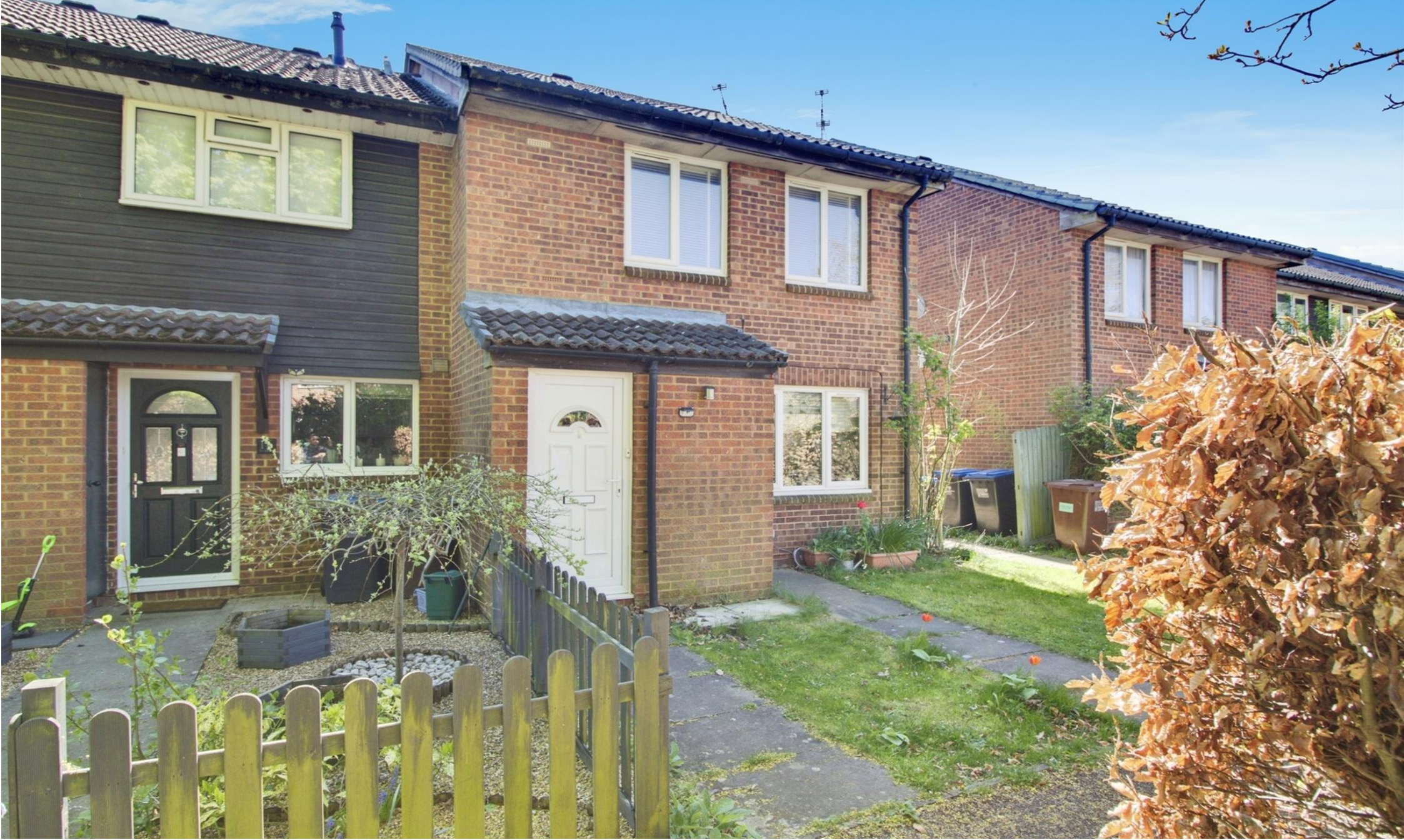
The Squirrels, Welwyn Garden City AL7 2JH