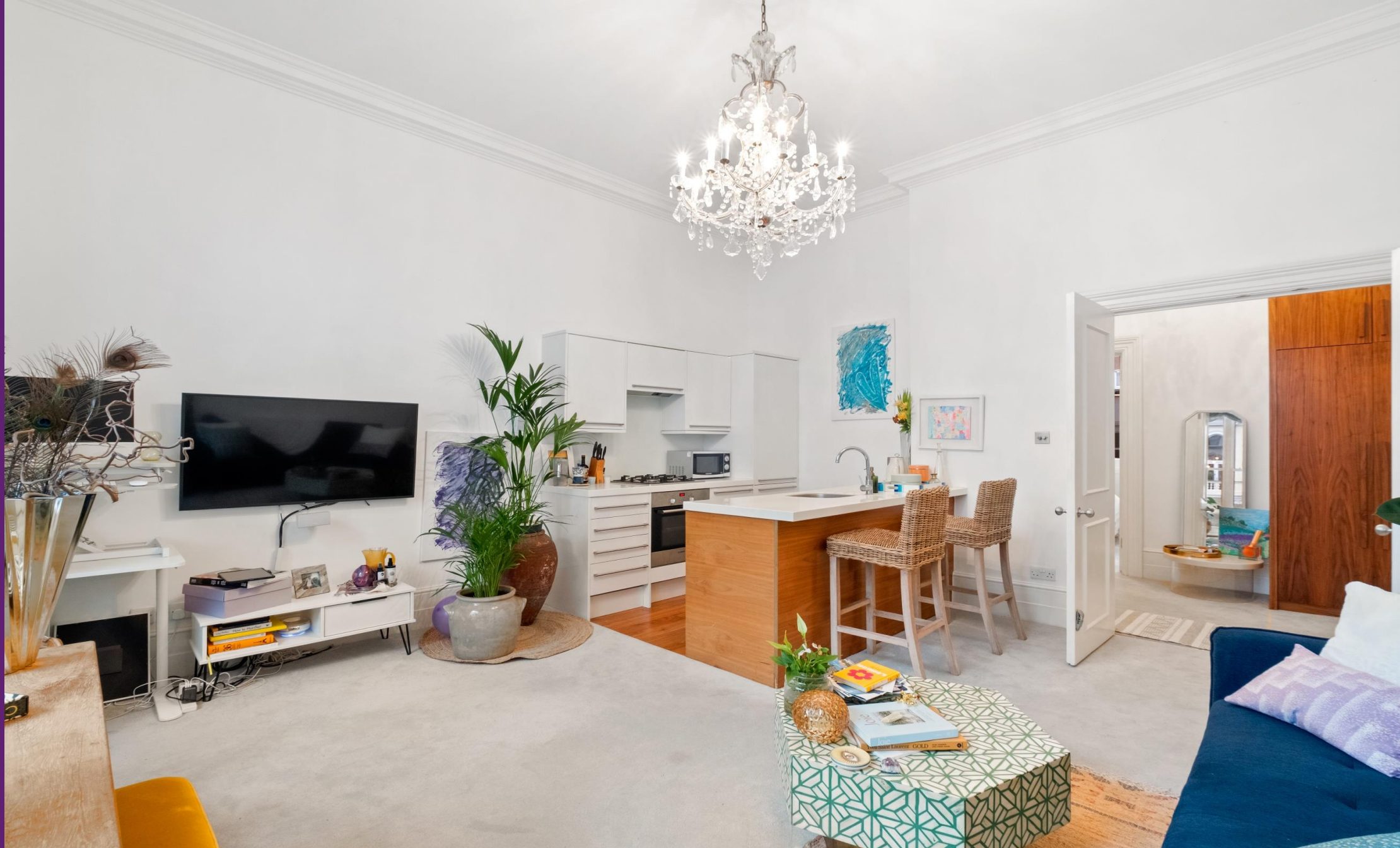
Queens Gate Terrace South Kensington, SW7