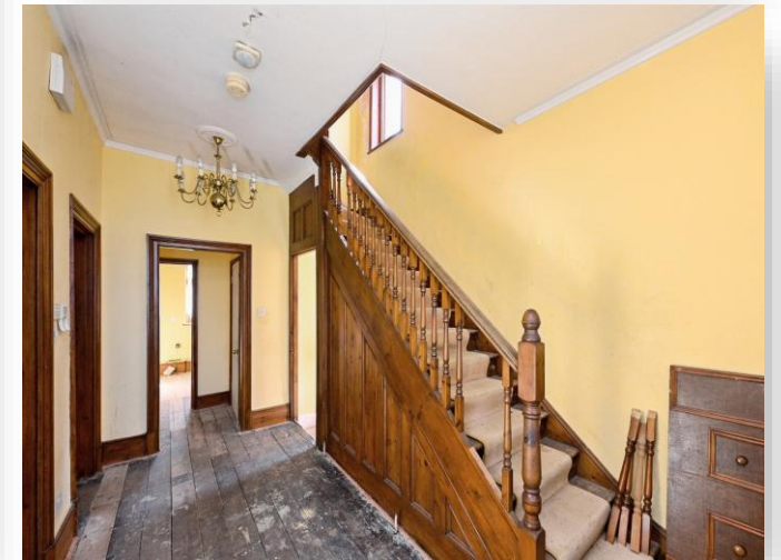
Westgate, Hunstanton PE36 5AL