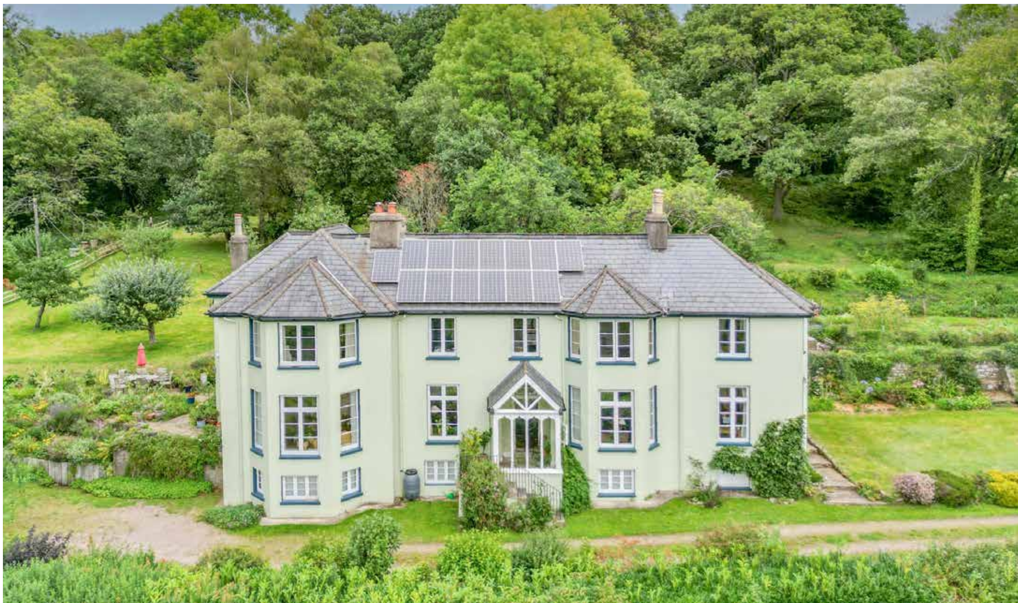
Hunters Lodge Hewelsfield | Lydney | GL15 6UT