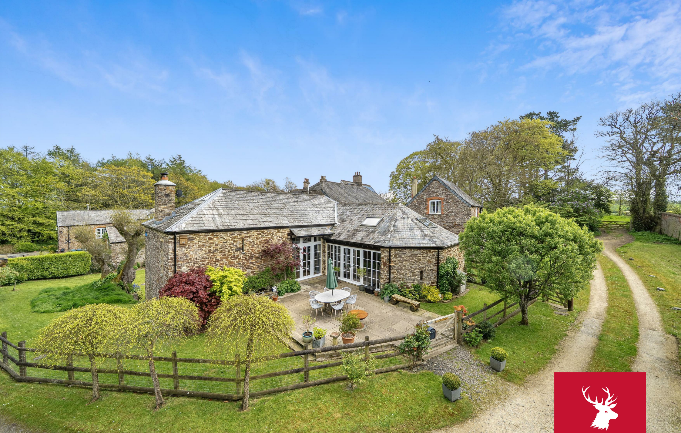
Barn Cottage, Townleigh Farm