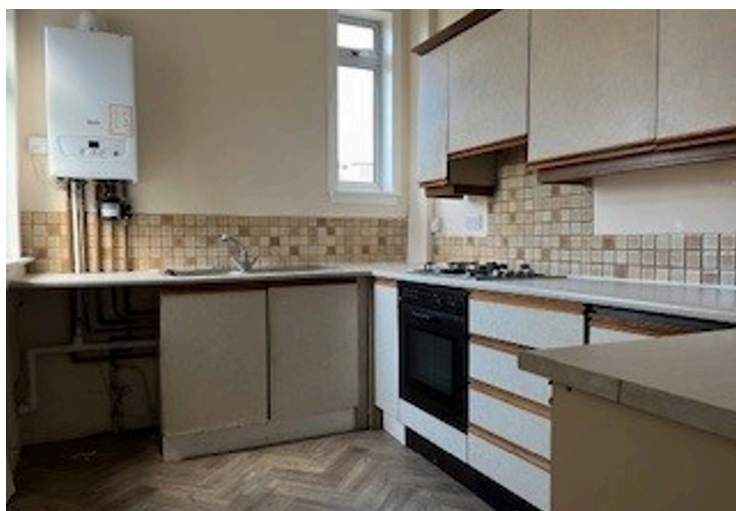
Flat A, 44 Forth Avenue, Kirkcaldy £750 pcm