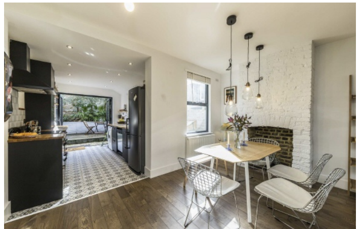
Red Lion Place, SE18