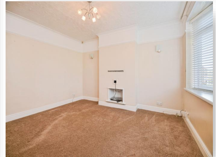
Lansdowne Road, Thornaby Stockton-On-Tees TS17 8EU