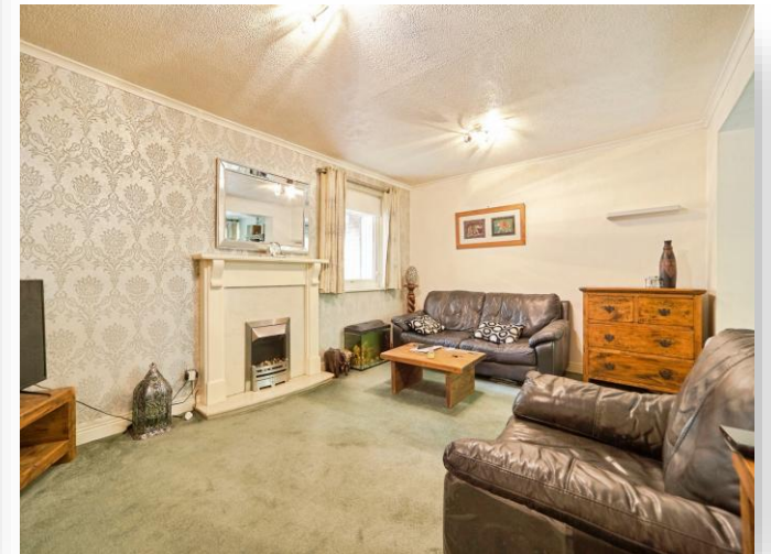
Frizley Gardens, BRADFORD BD9 4LY