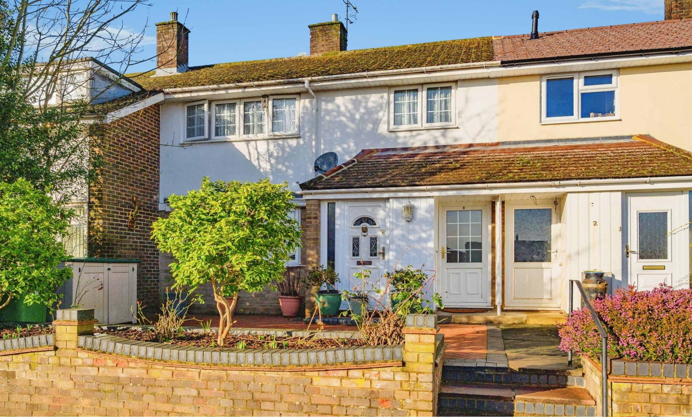
Catkin Close, Hemel Hempstead HP1 3EB