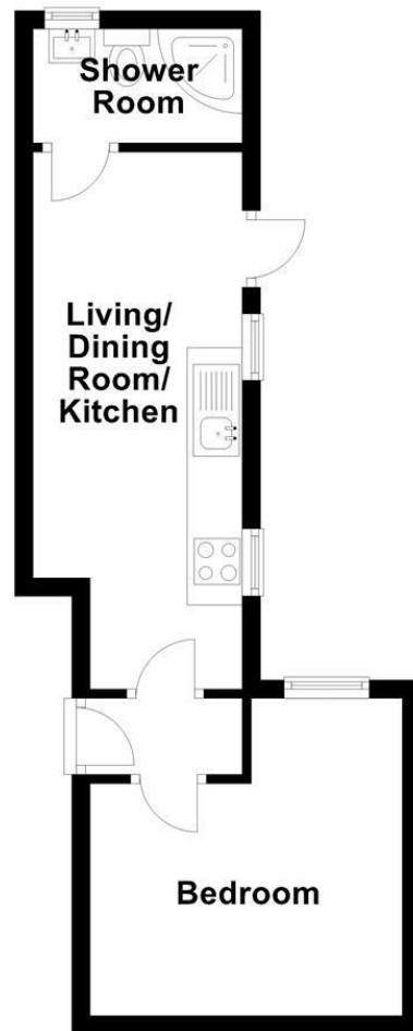
Not to scale. For illustrative purposes only

31B Stanley Street, Luton, Bedfordshire, LU1 5AL