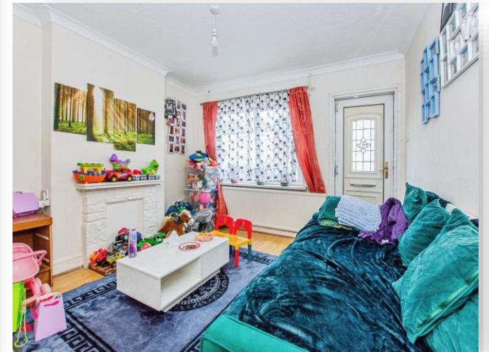
Osborne Road, Wisbech PE13 3JW