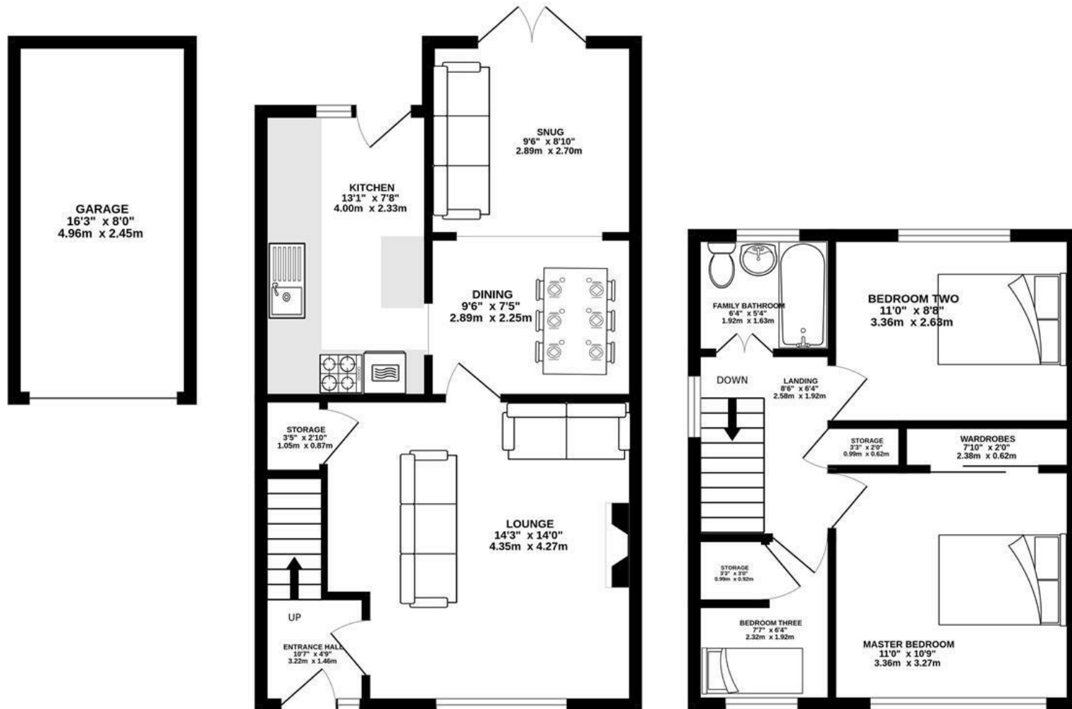
1ST FLOOR 371 sq.ft. (34.5 sq.m.) approx.

TOTAL FLOOR AREA : 992 sq.ft. (92.2 sq.m.) approx.