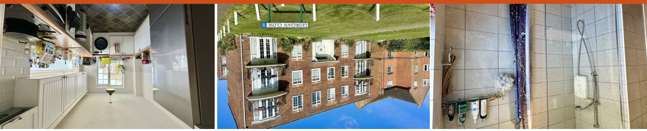
6 Georgian Close, Bexhill-On-Sea, TN40 2NN