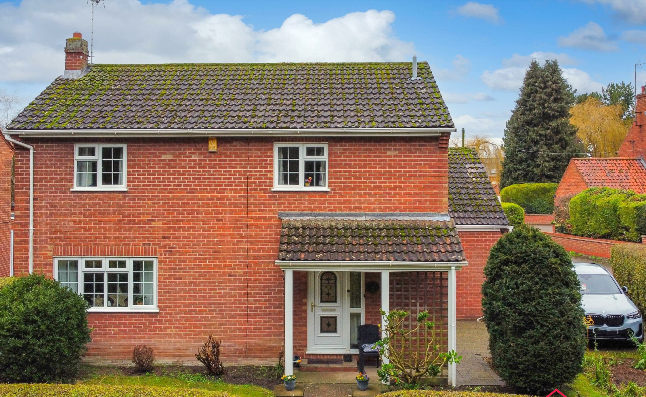
Tare Cottage, Main Street, Caunton, Newark