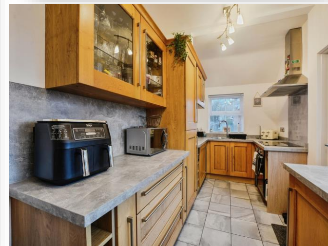
Church Lane, Skegness PE25 1EF