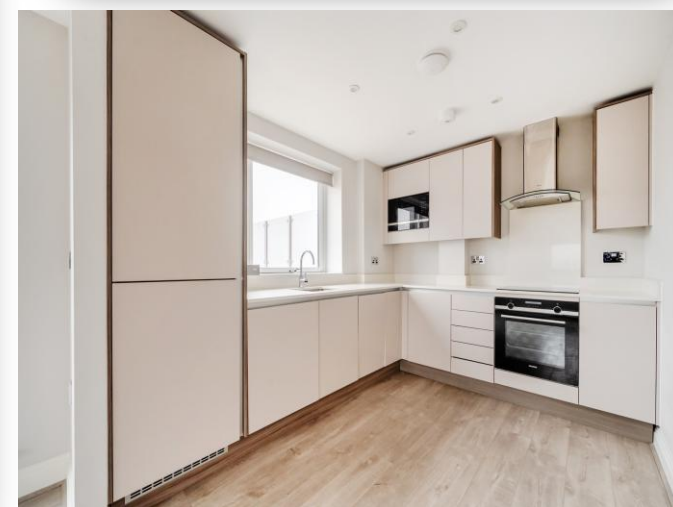
Apartment 68 Rialto, Crown Lane, Maidenhead SL6 1BX