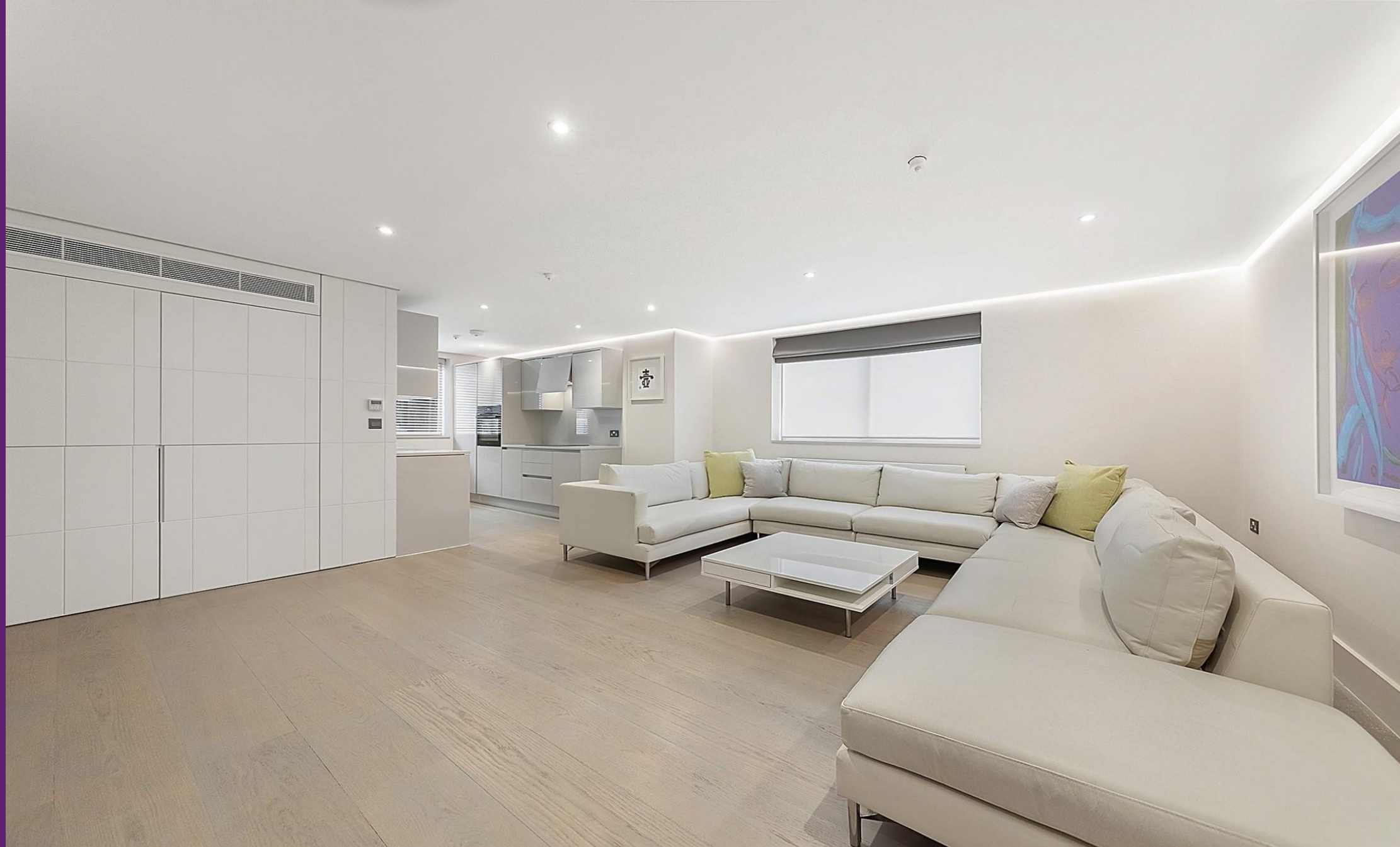
Thorburn House Kinnerton Street, SW1X