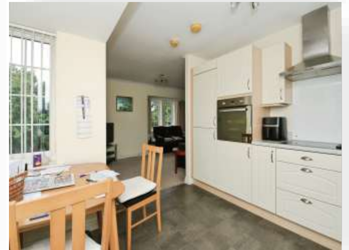
Spinney House Chapel Street, Yaxley Peterborough PE7 3LN