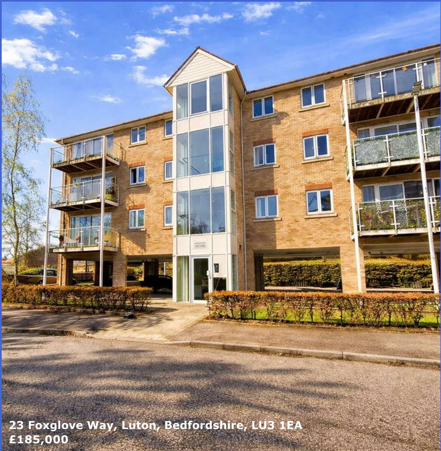
23 Foxglove Way, Luton, Bedfordshire, LU3 1EA £185,000