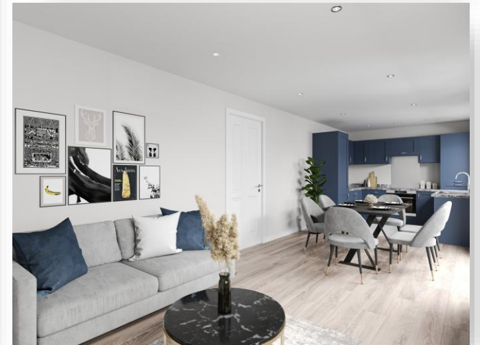
93 Woodside Meadows, Hartlepool, TS25 1DF