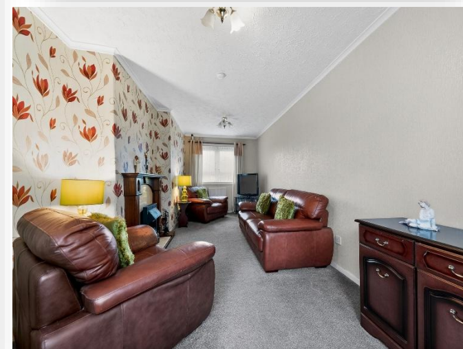
Rowantree Avenue, Rutherglen Glasgow G73 4LZ