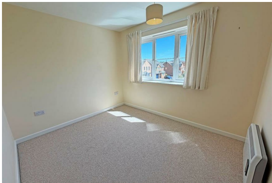
Lounge/Diner 18'1" max x 12'4" (5.52m max x 3.76m)