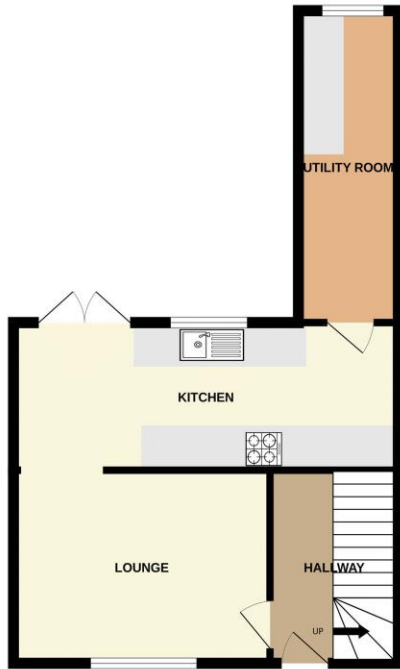
GROUND FLOOR 461 sq.ft. (42.8 sq.m.) approx.