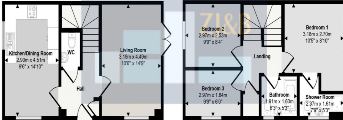
Ground Floor Approx 38 sq m / 410 sq ft

Approx Gross Internal Area 77 sq m / 830 sq ft