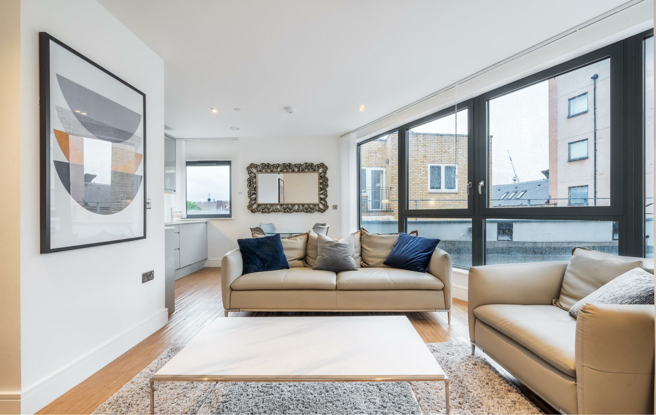
30 Jessica House Wandsworth High Street, London SW18 4RD £2,550 Per Month