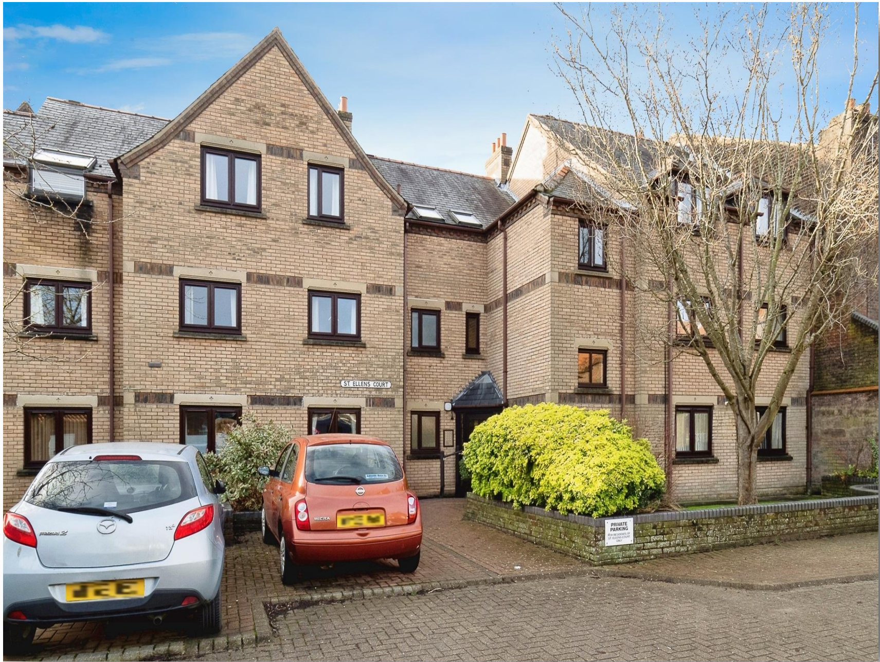
St. Ellens Court, Beverley, HU17 0HH