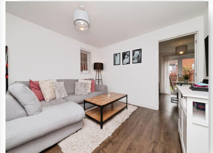
Brigade Drive, Cottingham HU16 5GQ