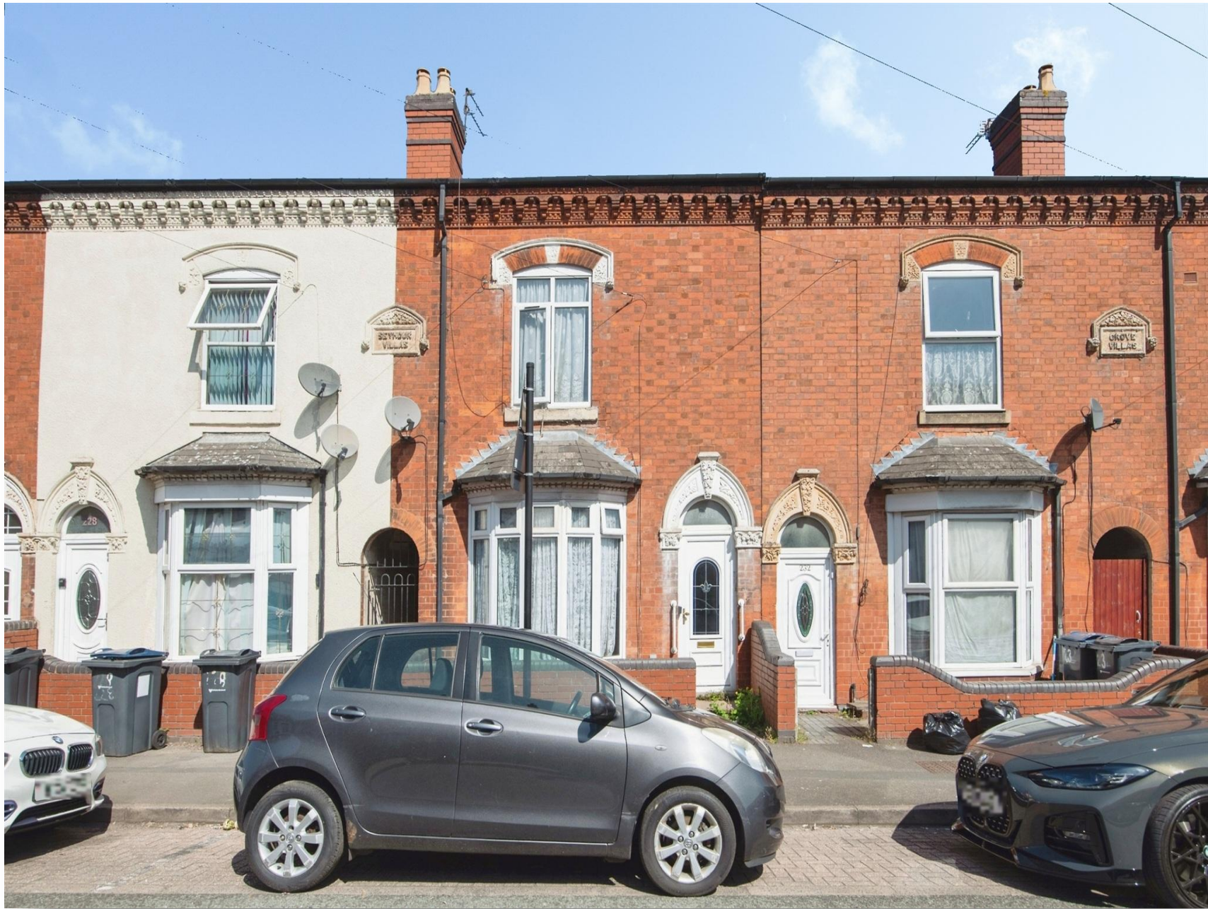
Albert Road, Aston Birmingham B6 5NL