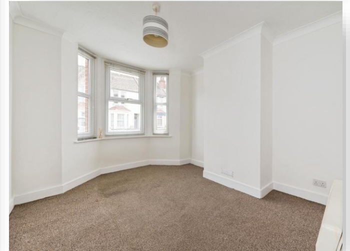
Ground Floor Flat, Nutbeem Road, Eastleigh. SO50 5JT