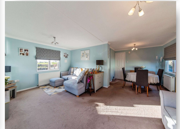
Riverbank Close Marina View, Dogdyke Lincoln LN4 4UJ