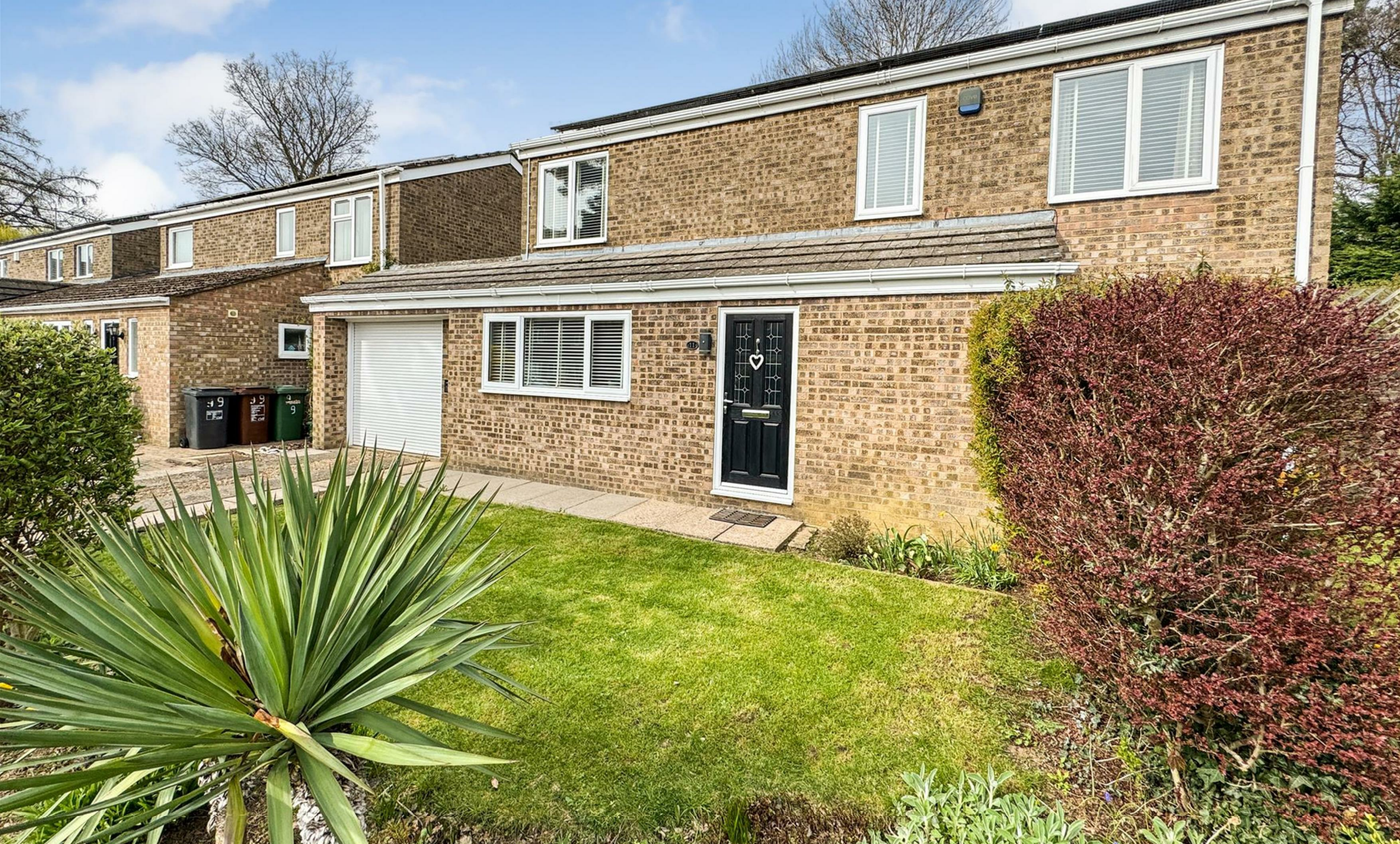
Brisbane Gardens, Corby