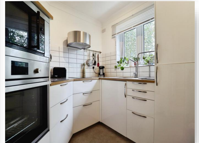
Cwrt Jubilee, Plymouth Road, Penarth, CF64 3DQ