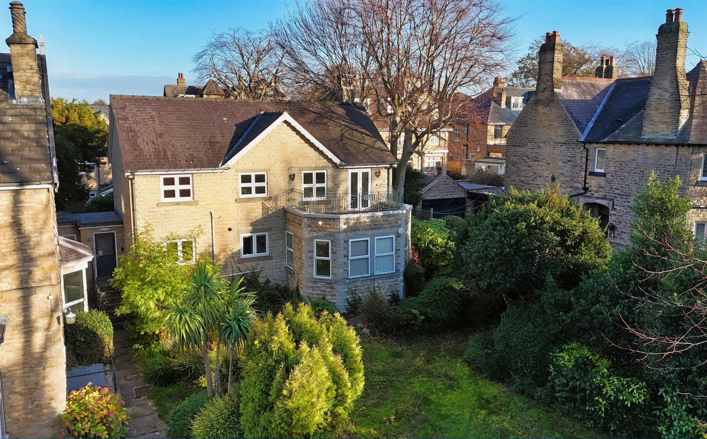
Beverley Lodge, 5A Kingfield Road, Brincliffe, Sheffield, S11 9AS