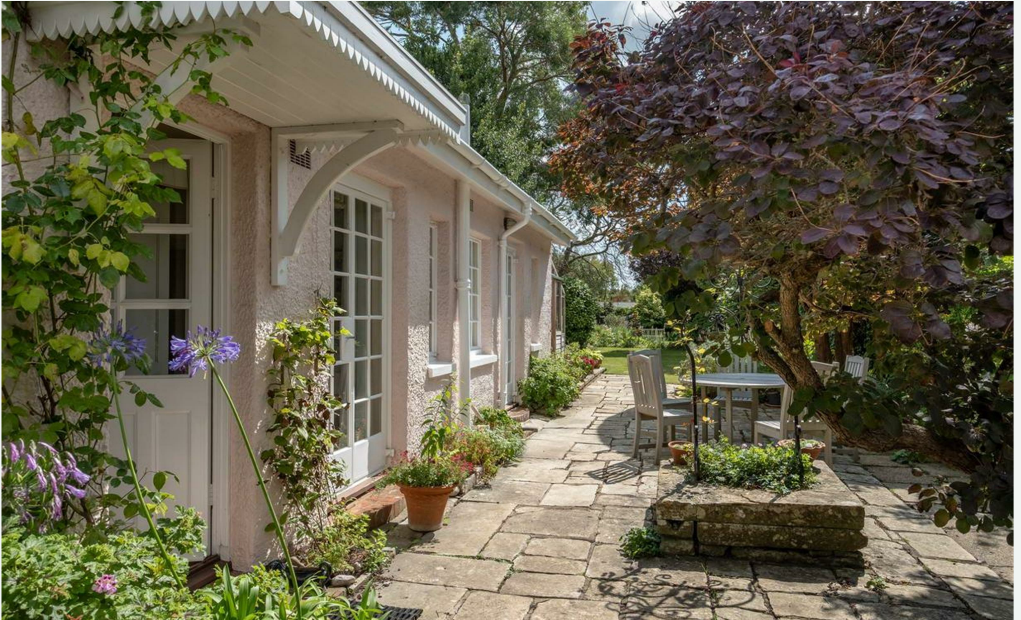
Rose Cottage, High Street, Bembridge, Isle Of Wight, PO35 5SE