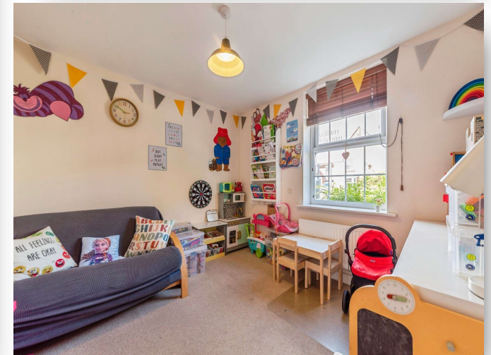
Tutt Close, Fernwood Newark NG24 3UL