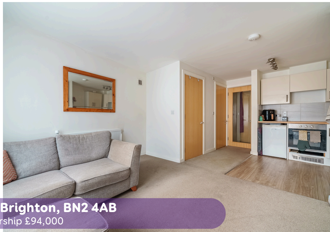
Freehold Terrace, Brighton, BN2 4AB Shared Ownership £94,000