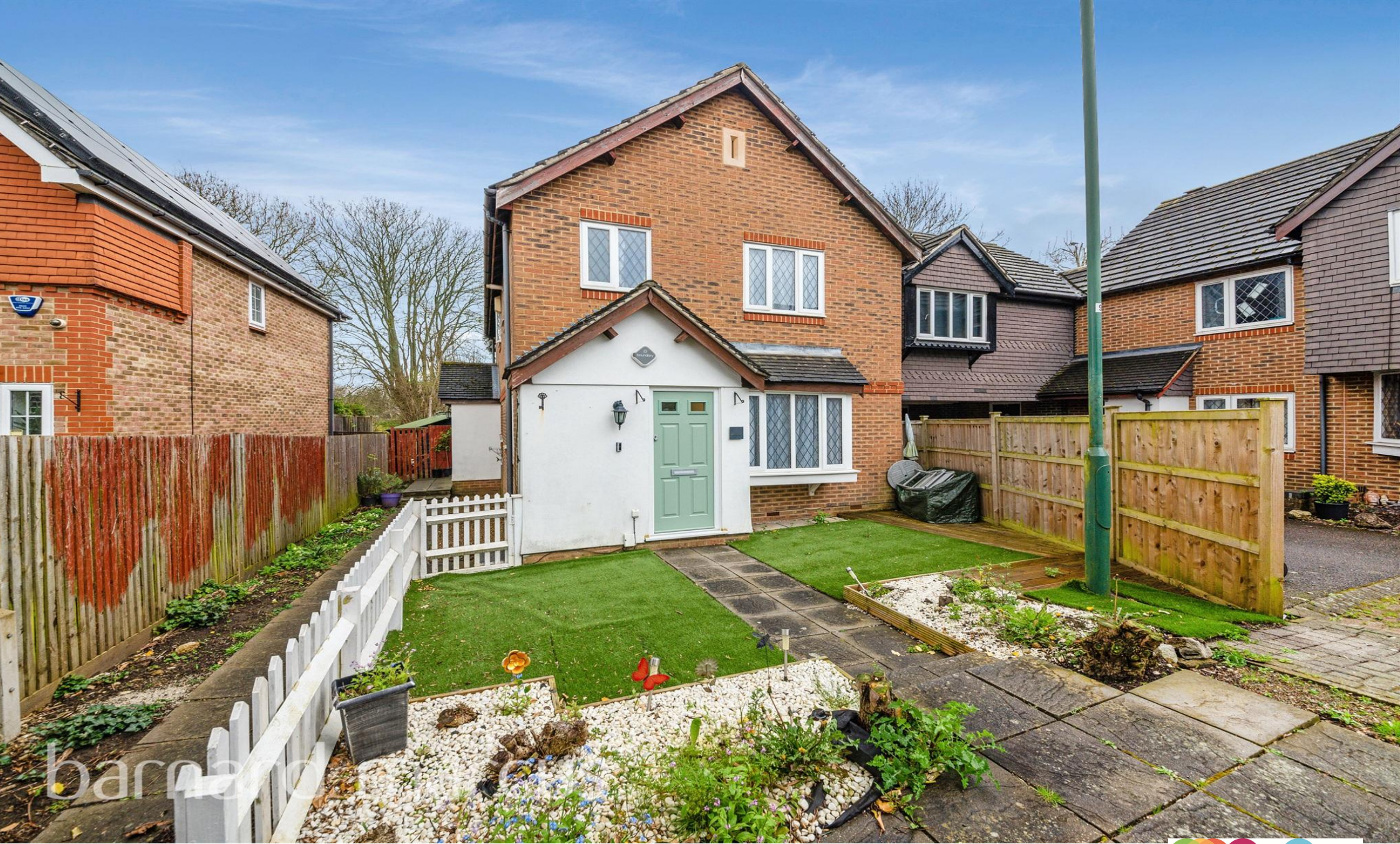
Sevenoaks Close, Sutton SM2 6NL