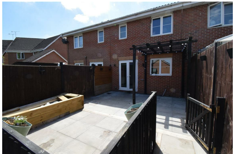
The rear garden is split into two levels and mainly being laid to patio. There is also a small block paved frontage.