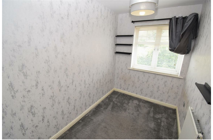
With window to the front, radiator.