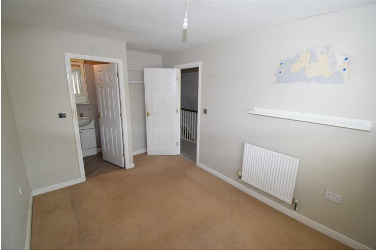
With window to the front, radiator, door to: