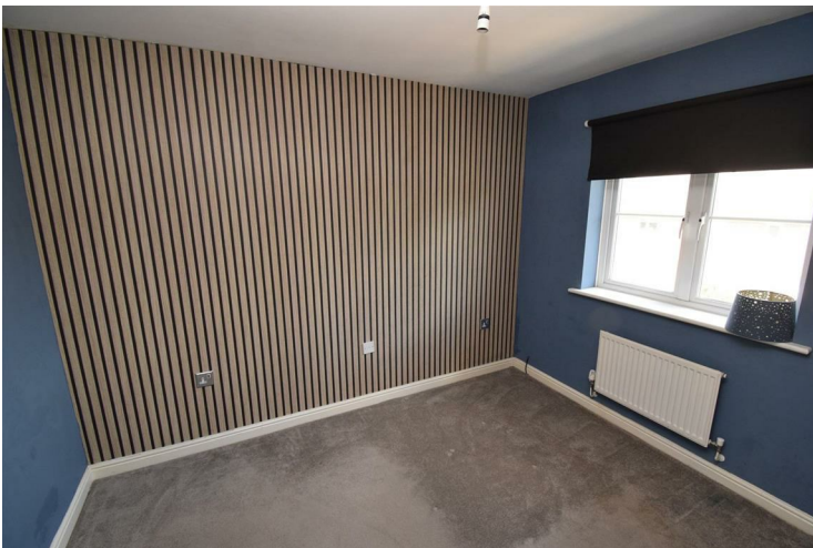
With window to the rear, radiator.