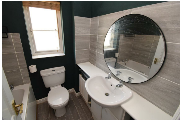
Fitted with a panelled bath, W.C., fitted vanity unit with inset wash hand basin, partially tiled walls, radiator, window to the rear.