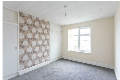
GROUND FLOOR 689 sq.ft. (64.3 sq.m.) approx.

IMPORTANT NOTE: These particulars and the descriptions and measurements herein do not constitute representation and whilst every effort has been made to ensure accuracy, this cannot be guaranteed.