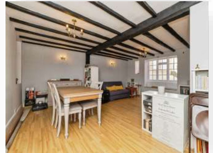
Town Wall, Hartlepool TS24 0JQ